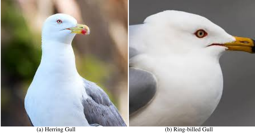
Figure 7: Visual comparison between a herring gull and a ring-billed gull.