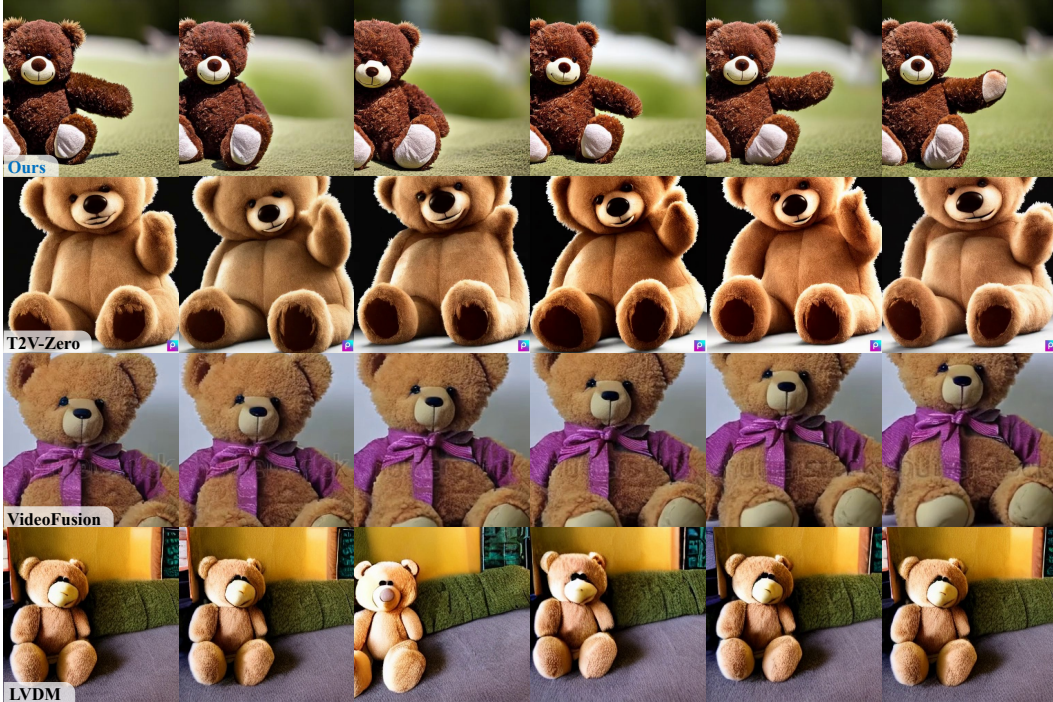
Figure 2: Additional Qualitative Comparisons. In the case of “light a match then the match goes out”, our method successfully depicts the entire process of a match from lightning, burning to extinguishing. In the case of “a teddy bear is greeting”, we exploit the world knowledge of LLM [7] to translate a greeting into a series of specific actions such as waving and smiling.