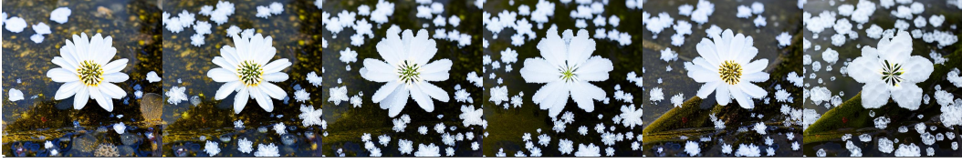
Figure 6: Extension - Long Video Story. Our method can generate the long video story based on a sequence of prompts.

3rd prompt: "The flower gradually freezes"