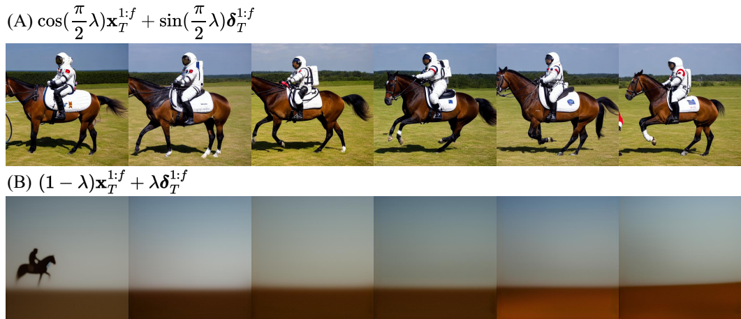
Figure 5: Analysis on Joint Noise Sampling. Without our proposed sampling, the initial noise at each single frame would not follow normal Gaussian distribution, resulting in corrupting frames.