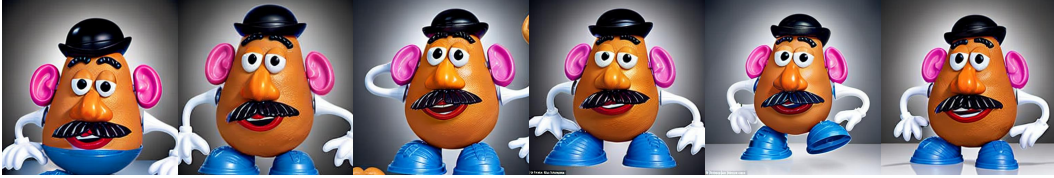
Figure 7: Extension - Personalization. Our method can generate videos with user-specific concepts. The tokens of "ccorgi dog", "modern disney style", and "sks mr potato head" are from their respective personalized models ccorgi-dog, Mo di Diffusion, and Mr Potato Head.