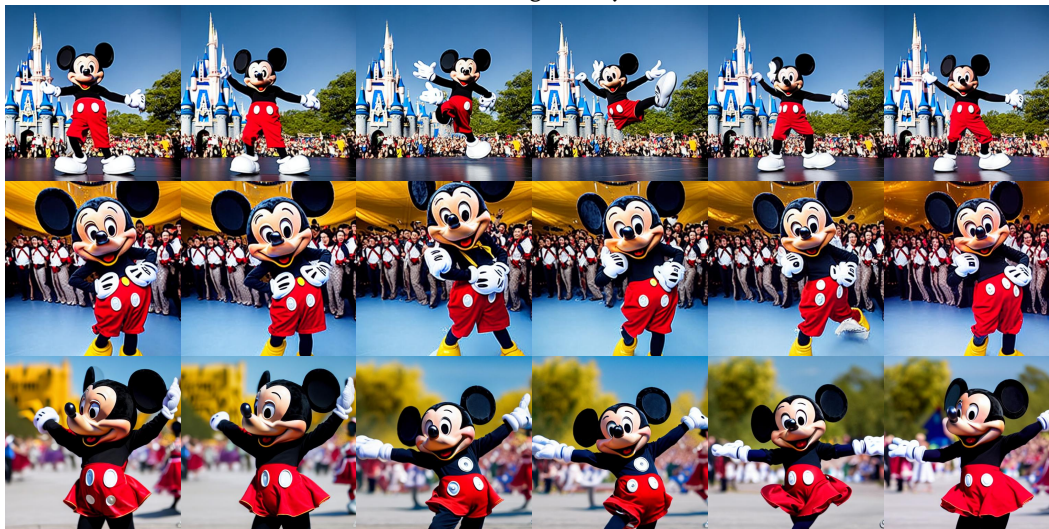
Figure 3: Additional Qualitative Results. Multiple results based on the same prompts are shown.