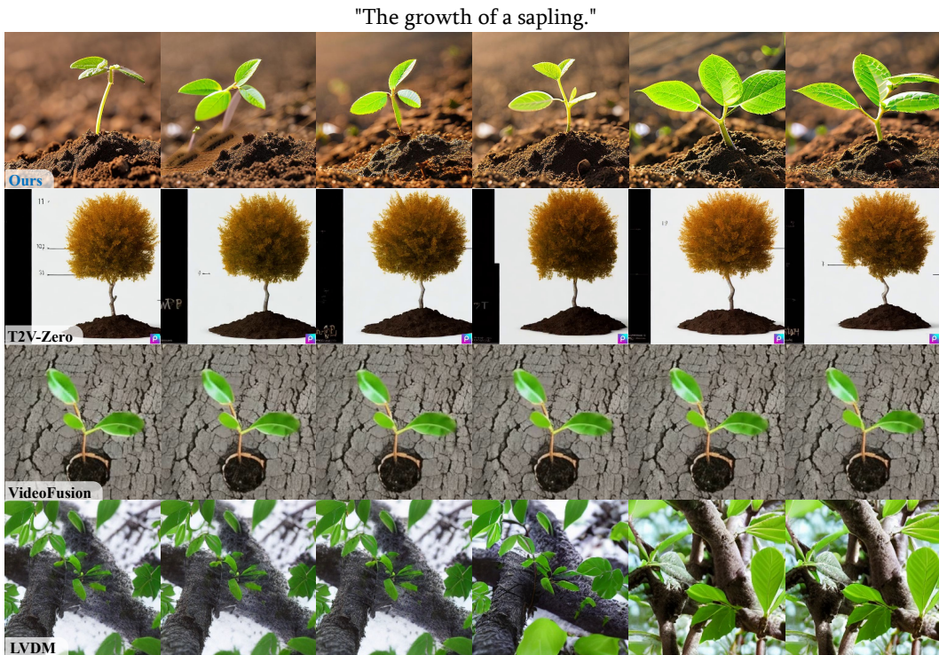
Figure 1: Additional Qualitative Comparisons. In the case of “Two supermen are fighting”, the LLM vividly decomposes the process of fighting into frames, with the fifth frame depicting “colliding in a dazzling display of sparks and force”, which is captured in our result. In the case of “the growth of a sapling”, our result clearly presents the gradual sprouting of a small sapling.