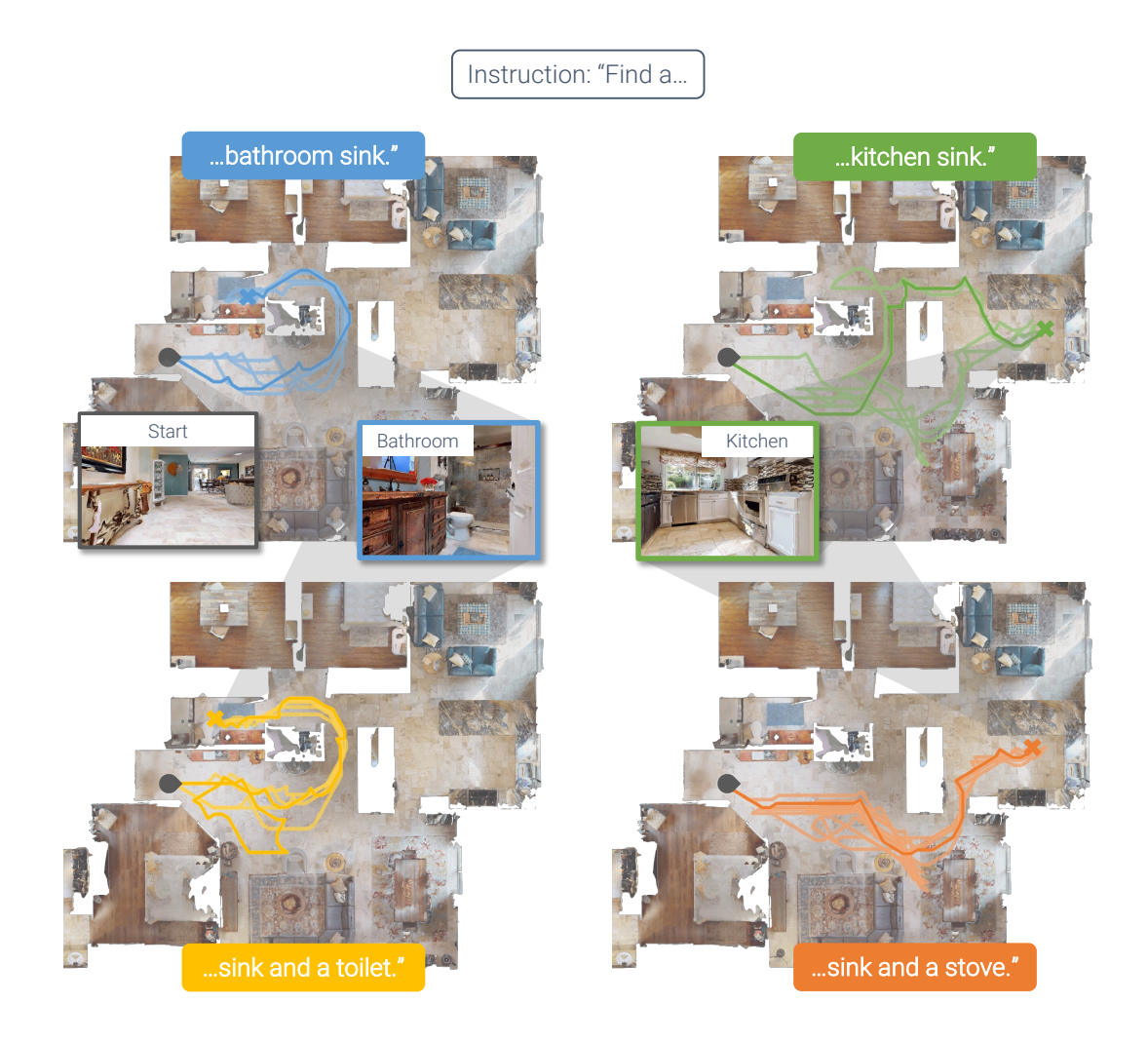
Figure 3: Qualitative examples for navigating to complex object descriptions. For each trail, the agent is spawned at the start position looking into the house (i.e., to the right on the maps) and given one of four instructions. Each instruction is run five times with the path for the first trail highlighted in bold colors. Our agent appropriately navigates to the correct rooms, demonstrating an understanding of both explicit ( "Find a kitchen sink" ) and implicit ( "Find a sink and a stove" ) room information.

We find that given room information such as " bathroom " or " kitchen ", the agent appropriately finds a " sink " in the corresponding rooms in the house. Furthermore, in these examples the agent does not enter the " kitchen " when prompted to look for a " bathroom sink ," and vice-versa. In these long trajectories (ranging from 88 to 225 steps), we observe more exploration in the living room and direct navigation when target rooms are visible. We qualitatively observe interesting learned behaviors – for instance, the agent often performs a 360° turn before navigating, possibly to survey the environment.