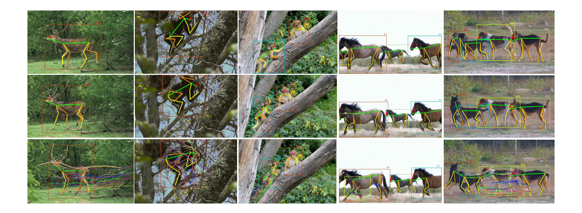
Figure 1: A glance of some examples from the proposed APT-36K dataset. The five columns of images show single animal instance, complex movements, and multiple animal instances, respectively. The keypoint trajectories of some animal instances are shown in the last frames. Best viewed in color.

specific kind of animals. They do help advance the research of pose estimation for these animals. However, since there exist huge appearance variance, behavior difference, and joint distribution shifts among various animal species due to evolution, the models trained on these datasets do not perform well on unseen animal species, leading to poor generalization performance. To further facilitate the research on animal pose estimation, datasets covering multiple animal species with keypoint annotations are proposed, e.g. , Animal-Pose [7] and AP-10K [40]. Despite their large scale in dataset volume and diversity in animal species, they lack important temporal information, making it unexplored to recognize poses in contiguous frames, which is very important for animal action recognition and beyond.