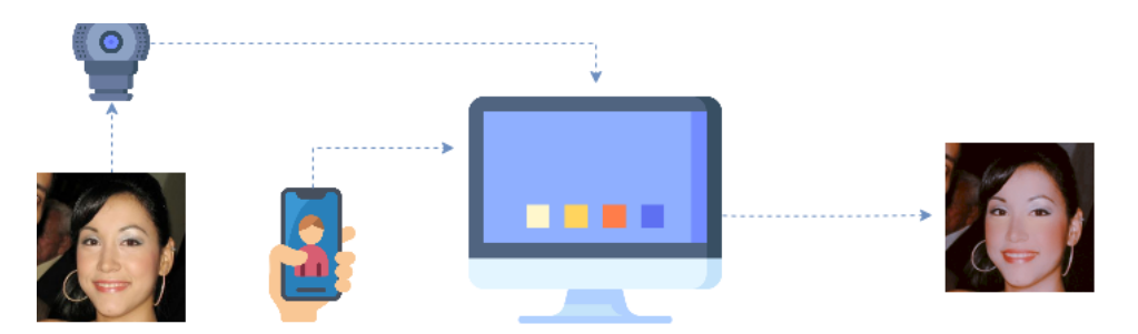
Figure 1: OPENFILTER pipeline. A machine runs the targeted social media application (e.g. Instagram) on an Android emulator. An image from the dataset is projected on the camera opened through the social media application. A filter is directly applied to the image. This Figure has been designed using resources from Flaticon<sup>1</sup> and [30].

Augmented Reality or AR filters on selfies have become very popular on social media platforms for a variety of applications, including marketing, entertainment and aesthetics. Given the wide adoption of AR face filters and the importance of faces in our social structures and relations, there is increased interest by the scientific community to analyze the impact of such filters from a psychological, artistic and sociological perspective. However, there are few quantitative analyses in this area mainly due to a lack of publicly available datasets of facial images with applied AR filters. The proprietary, close nature of most social media platforms does not allow users, scientists and practitioners to access the code and the details of the available AR face filters. Scraping faces from these platforms to collect data is ethically unacceptable and should, therefore, be avoided in research. In this paper, we present OPENFILTER, a flexible framework to apply AR filters available in social media platforms on existing large collections of human faces. Moreover, we share FAIRBEAUTY and B-LFW, two beautified versions of the publicly available FAIRFACE and LFW datasets and we outline insights derived from the analysis of these beautified datasets.