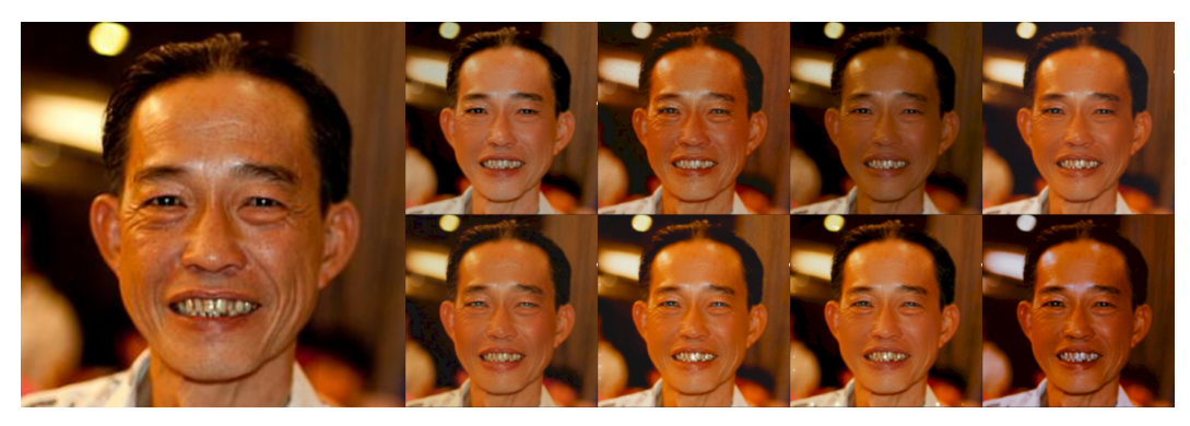
Figure 2: Example of the eight different beauty filters applied to the left-most image [30]. From left to right and top to bottom: filter 0 -pretty by herusugiarta ; filter 1 -hari beauty by hariani ; filter 2 -Just Baby by blondinochkavika ; filter 3 -Shiny Foxy , filter 4 -Caramel Macchiato and filter 5 -Cute baby face by sasha_soul_art ; filter 6 -Baby_cute_face_ by anya__ilicheva ; filter 7 -big city life by triutra .

individuals who appeared in the news and hence are public figures. In this work, we have beautified LFW with the same eight popular Instagram beauty filters described above and depicted in Figure 2, using different filters on different images from the same individuals.