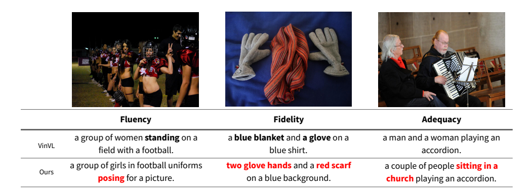
Figure 3: Example results and comparisons for image captions produced by VinVL and ours in terms of fluency, fidelity and adequacy. Note that both utilize VIVO for novel object detection.