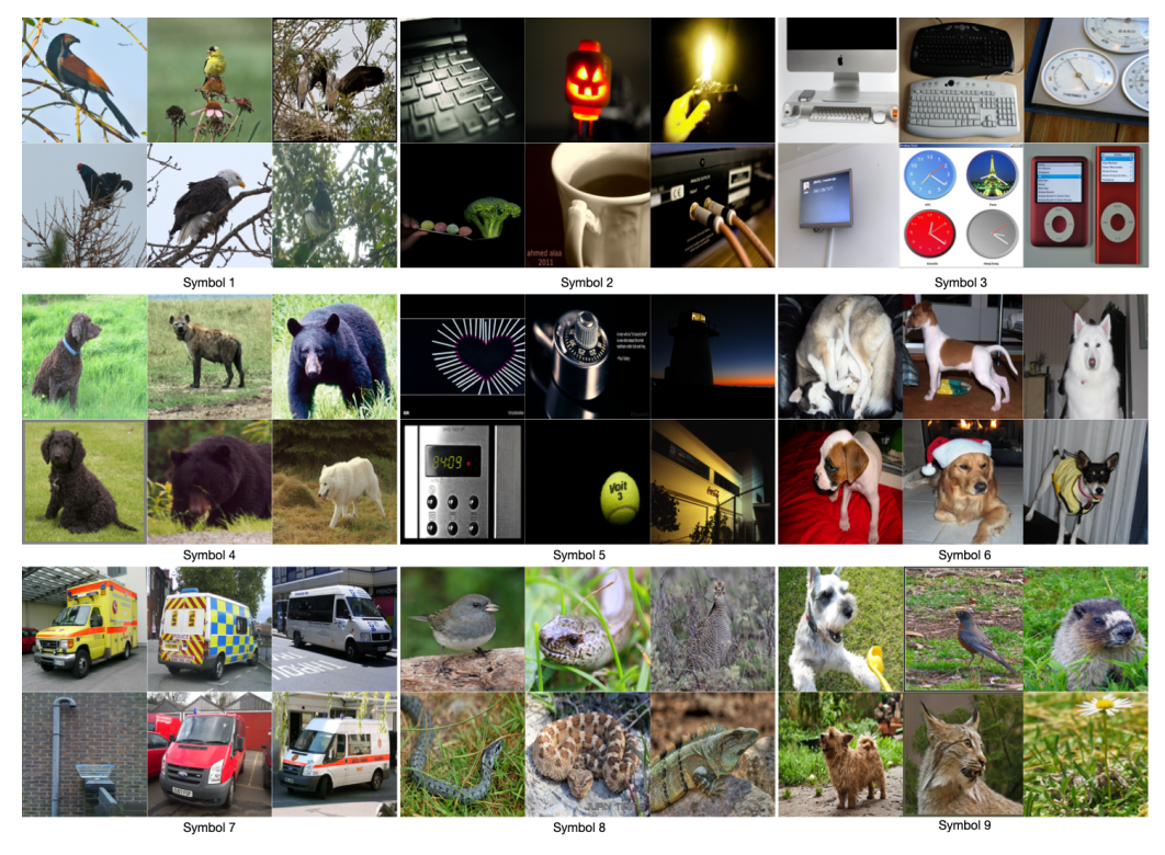
Figure 3: Randomly selected ILSVRC-val images triggering the +augmentations -shared Sender to produce its 9 most frequent symbols.