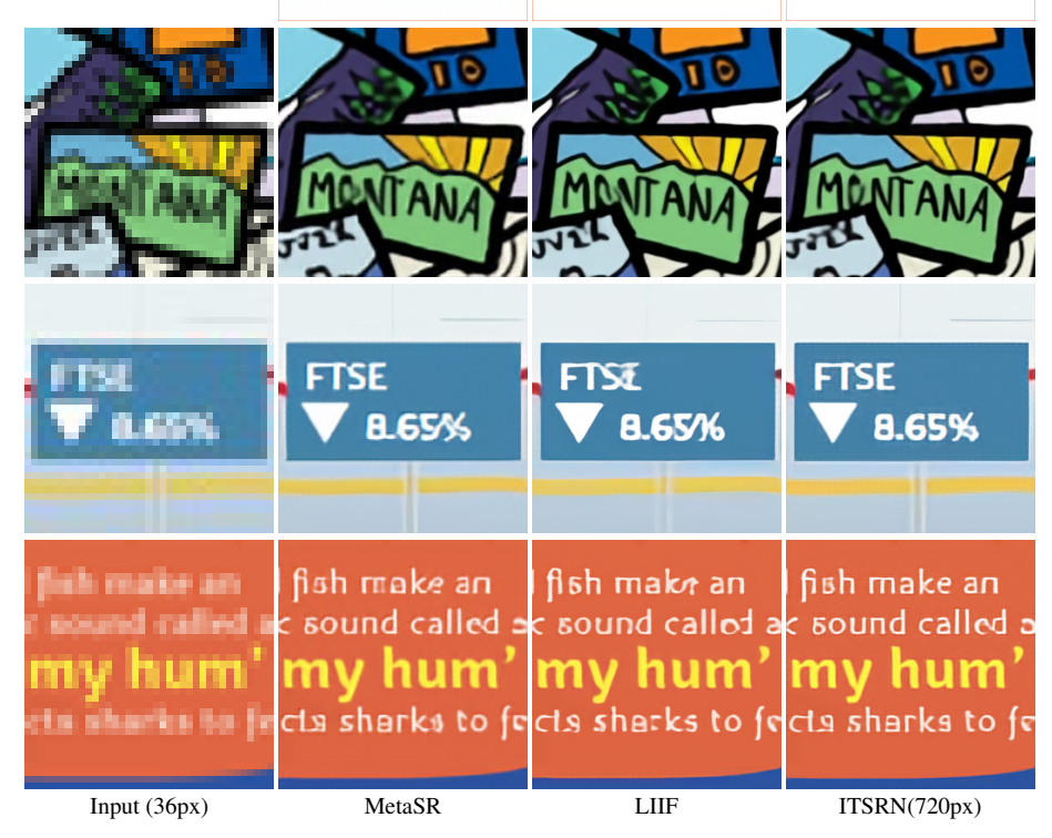
Figure 2: Visual comparison with state-of-the-arts for arbitrary SR results. The input is a 36 \times 36 patch from an image in SCI1K test set. All the three models are trained with continuous scales in the range \times 1 \sim \times 4 and are tested for \times 20 magnification. Note that the LR input is generated with \times 4 downsampling, and there is no ground truth for its \times 20 magnification.