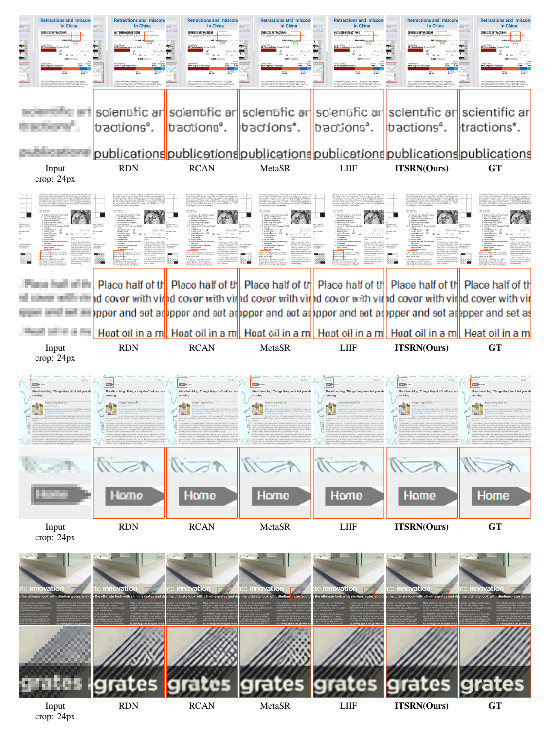
Figure 3: Visual comparison with state-of-the-arts at ×4 SR. The cropped patch size is given at the bottom of the LR input.