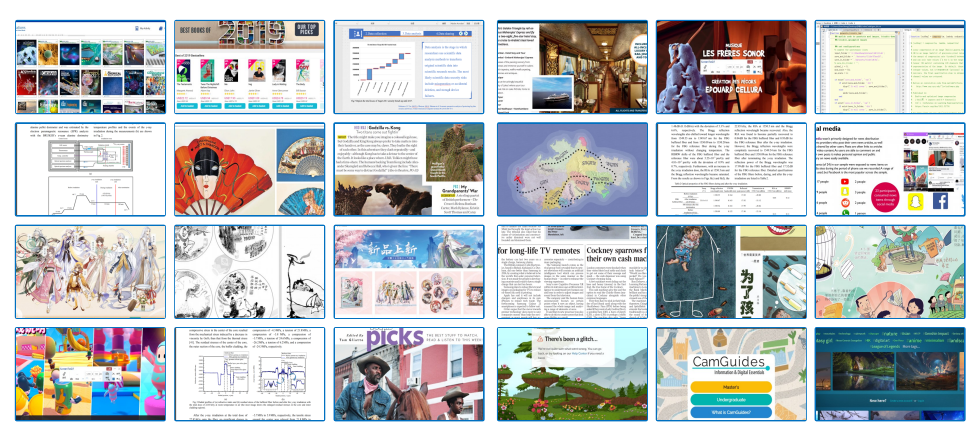
Figure 1: Sample images in our SCI1K dataset.