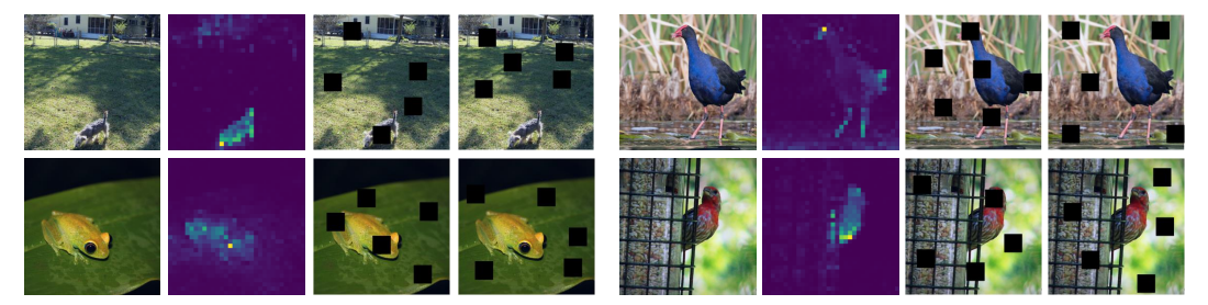
Figure 2: Illustration of our attention-guided mask strategy. It improves by preserving key patterns in images, compared with the original random mask. Description of images from left to right: (a) the input image, (b) attention map obtained by self-attention module, (c) random mask strategy which may cause loss of crucial features, (d) our attention-guided mask strategy that only masks nonessential regions. In fact, the masked strategy is to mask tokens.