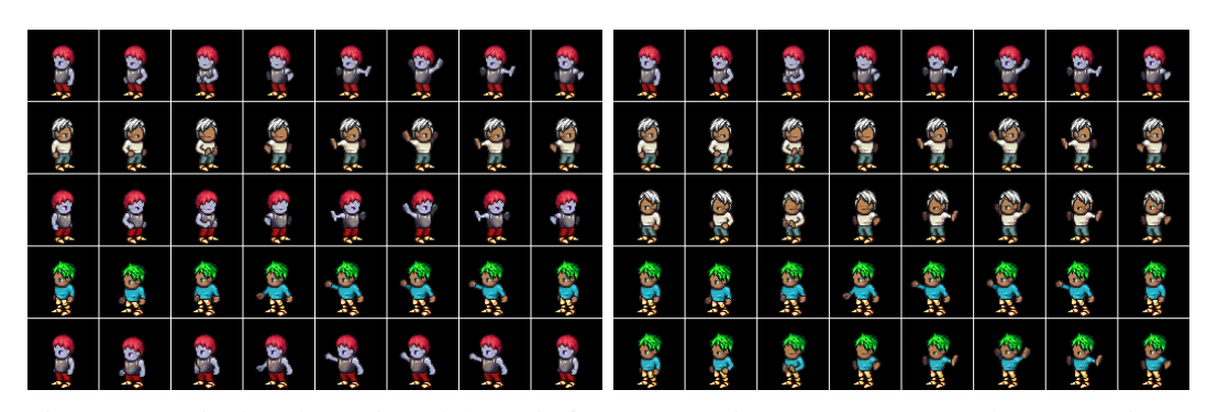
Figure 3: Manipulate the static and dynamic factors on Sprites. Row 1, 2, 4 are the raw test input sequences, while row 3, 5 are manipulated generations. Left panel: Row 3 uses s from row 1 and z_{1:T} from row 2. Row 5 uses s from row 1 and z_{1:T} from row 4. Right panel: Row 3 uses z_{1:T} from row 1 and s from row 2. Row 5 uses z_{1:T} from row 1 and s from row 4.