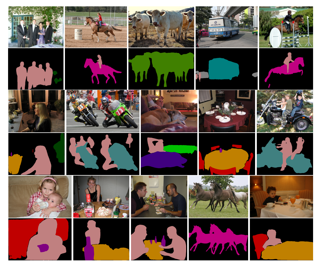
Figure 4: Qualitative results on PASCAL VOC 12 val set. Best viewed in color and zoom in.