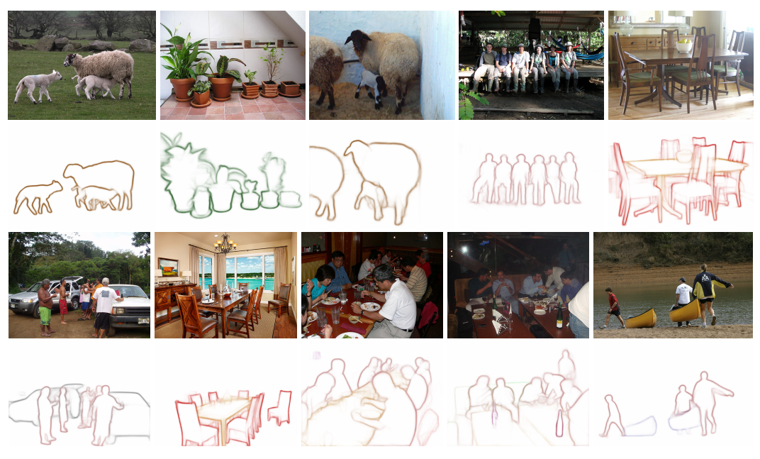
Figure 3: Qualitative results on SBD re-annotated test set. Best viewed in color and zoom in.

Additional visualization on VOC12. We visualize the semantic segmentation results on PASCAL VOC12 and illustrate them in Figure 4. One could see that the proposed method is able to produce spatially smoothed predictions while capturing structural details.