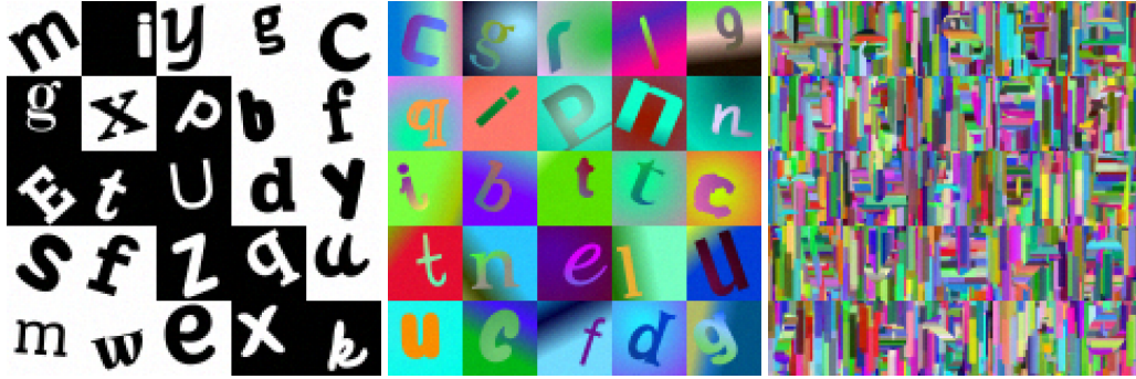
Figure 7: Unsupervised Representation Learning: Samples from datasets of Section 3.4 Left: Solid Pattern dataset. Center: Shades dataset. Right: Camouflage dataset.

bottom of "M". For camouflage, the VAE was unable to generate some of the characters, while they can still be recognized in the HVAE reconstructions, see letter "R".