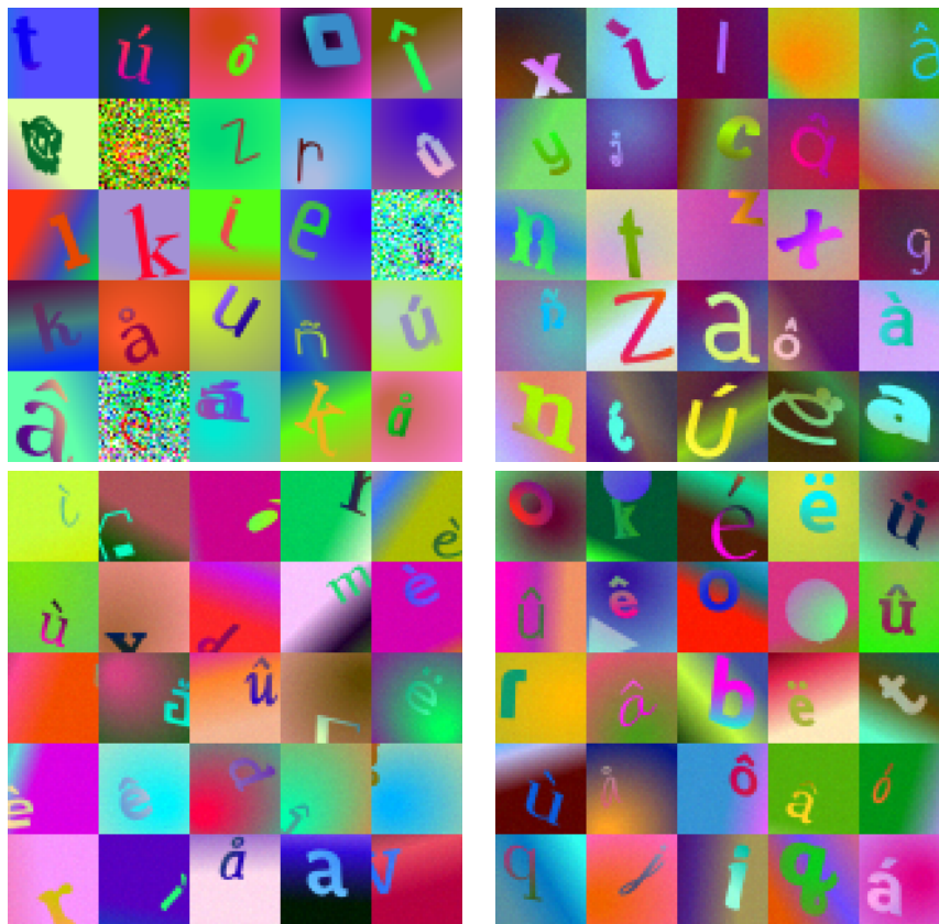
Figure 5: Active Learning . Samples from datasets of Section 3.3. Upper Left : 50% pixel noise dataset. Upper Right : 10% Missing dataset. Lower left : Out of the Box dataset. Lower Right : 20% Occluded dataset.

For calibration, we train the extra calibration layer for 10 epochs on the validation set. Following Kull et al. [33], we use the Adam optimizer and train two times, the latter with a reduced learning rate.