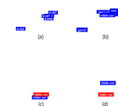
Figure 3: Example of how parts of our model work.