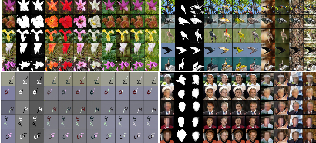
Figure 2: Generated samples (not cherry-picked, zoom in for better visibility). For each dataset, the columns are from left to right: 1) input images, 2) ground truth masks, 3) masks inferred by the model for object one, 4-7) generation by redrawing object one, 8-11) generation by redrawing object two. As we keep the same z_i on any given column, the color and texture of the redrawn object is kept constant across rows. More samples are provided in Supplementary materials. Faces from the LFW dataset have been anonymized, in visualisations only, to protect personality rights.