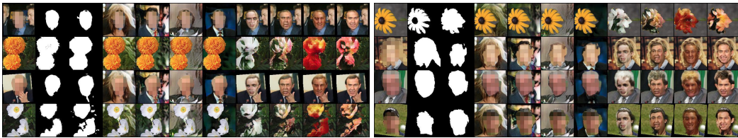
Figure 3: Results on LFW + Flowers dataset, arranged as in Figure 2. As z is kept constant on a column across all rows, we can observe that z codes for different textures depending on the class of the image even though the generator is never given this information explicitly. Faces from the LFW dataset have been anonymized, in visualisations only, to protect personality rights.

We also compared the performance of ReDO, which is unsupervised, with a supervised method, keeping the same architecture for F in both cases. We analyze how many training samples are needed to reach the performance of the unsupervised model (see Figure 4). One can see that the unsupervised results are in the range of the ones obtained with a supervised method, and usually outperform supervised models trained with less than around 50 or 100 examples depending on the dataset. For instance, on the LFW Dataset, the unsupervised model obtains about 92% of accuracy and 79% IoU and the supervised model needs 50-60 labeled examples to reach similar performance.