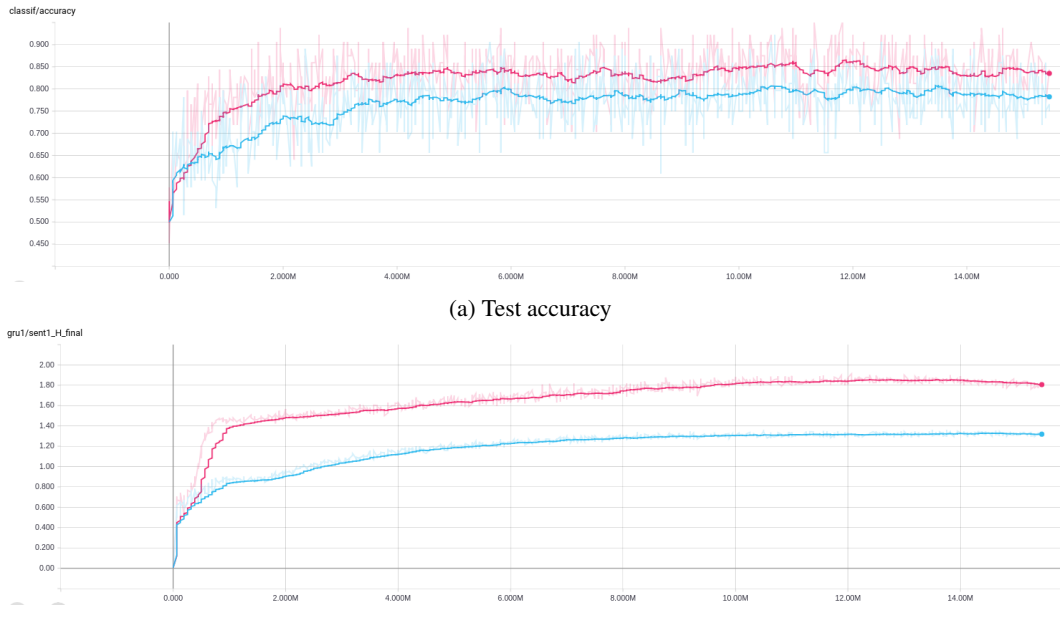
(b) Norm of the first sentence. Averaged over all sentences in the test set.