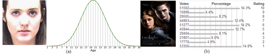
Figure 1: The real-world data which are suitable to be modeled by label distribution learning. (a) Estimated facial ages (a unimodal distribution). (b) Rating distribution of crowd opinion on a movie (a multimodal distribution).