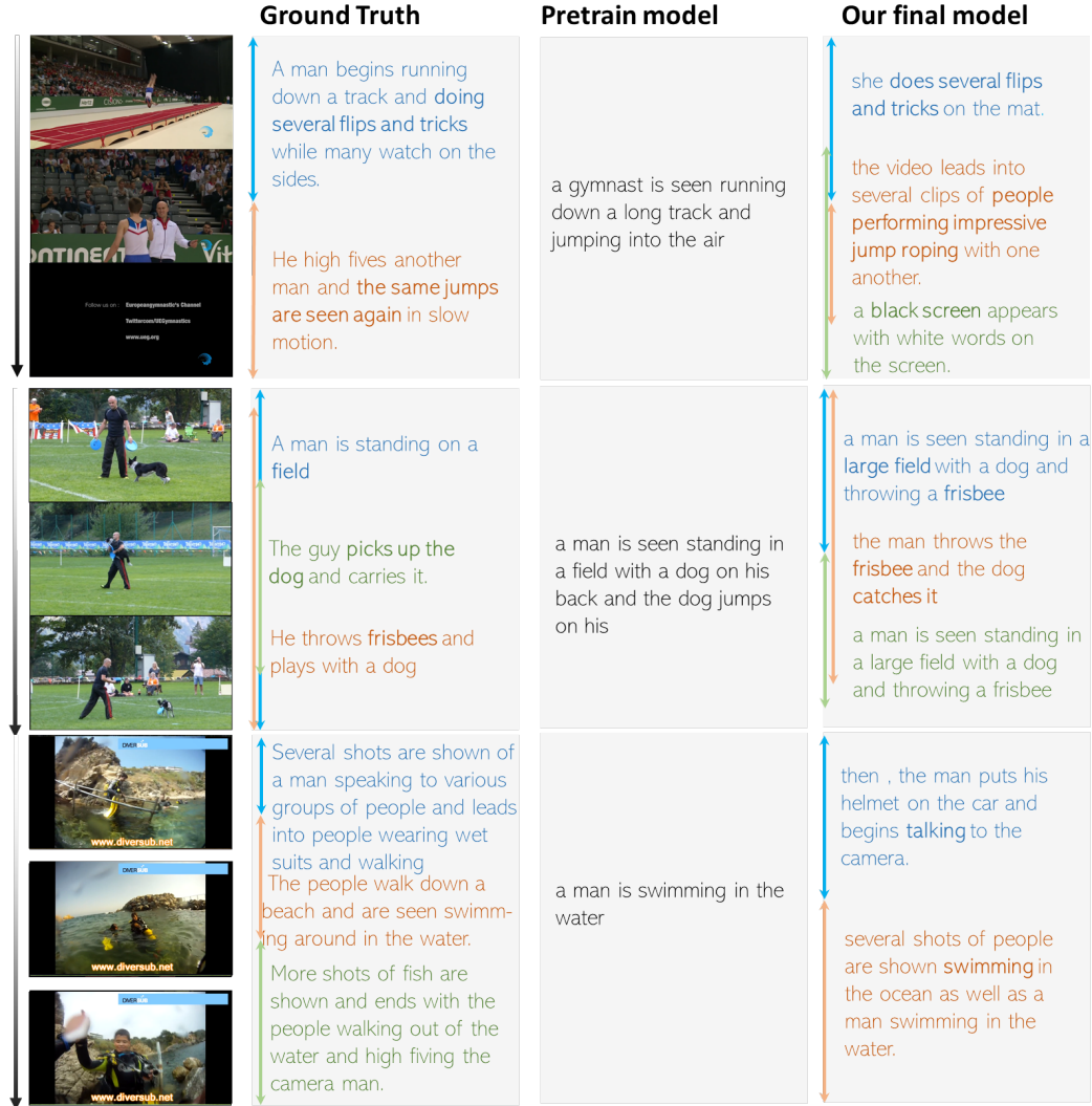
Figure 3: Illustration of the generated dense event captions. Left is the ground truth, middle is the generation of our pretrained caption model, and right is by our weakly-supervised training approach. Different colors indicate different temporal segments and sentence descriptions.

We raise a new task termed Weakly Supervised Dense Event Caption(WS-DEC) and propose an efficient method to tackle it. The weak supervision is of great importance as it eliminates the source-consuming annotation of accurate temporal coordinates and encourages us to explore the huge amount of videos in the wild. The proposed solution not only solves the task efficiently but also provides an unsupervised method for sentence localization. Extensive experiments on both tasks verify the effectiveness of our model. For future research, one potential direction is to verify our model by performing experiments directly on Web videos. Meanwhile, since weakly supervised learning is becoming an important research vein in the domain, our proposed method by using the cycle process and fixed-point iteration could be applied to more other tasks, e.g. , weakly-supervised detection.