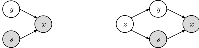
(a) y and s are marginally independent (b) y and s are not marginally independent

In this section, we formulate our problem and then present the proposed framework of learning invariant features.