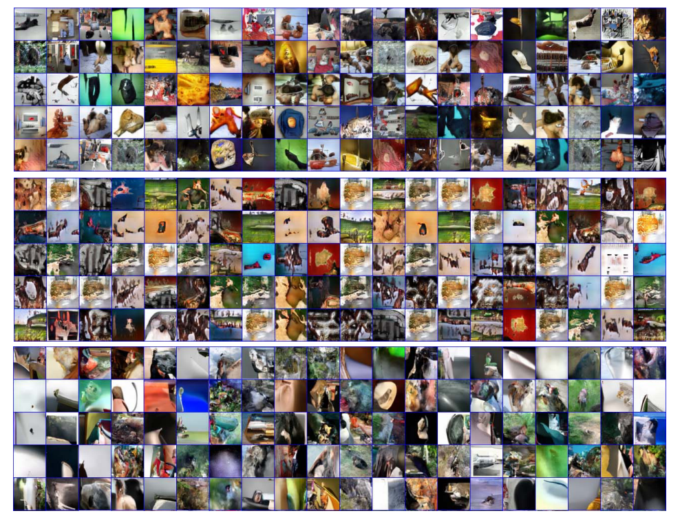
Figure 4: Generated samples trained on ImageNet. (Top) AS-VAE; (Middle) DCGAN [5];(Bottom) Pixel-CNN++ [40].