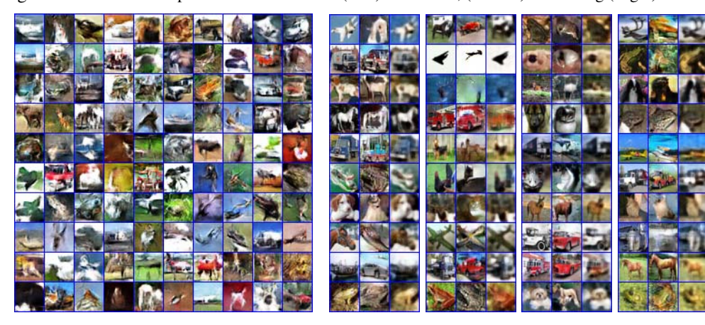
when trained on CIFAR-10.